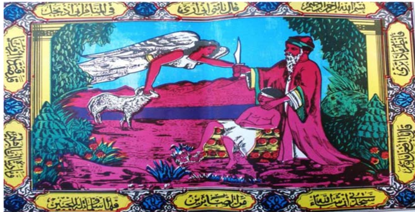
Fig. 1 – Depictions of Abrahamic sacrifice.

or fame (e.g. figures of famous rulers). Early images available in northern Nigeria were stylized drawings of Adam and Eve, as well as Companions of the Prophet Muhammad such as Ali, and later, Sufi Sheikhs such as Abdul-Qadir Jailani of Baghdad (founder of Qadiriyya Sufi brotherhood). An example of such posters is given in Fig. 1 which shows the Abrahamic attempted sacrifice of Isaac (Genesis 22:1-19) or Isma'il (Qur'an, 37:99-113).