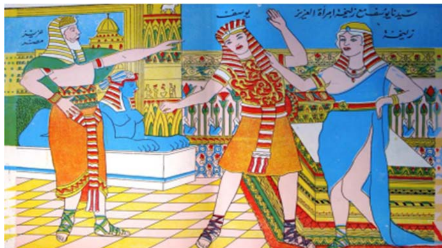
Fig. 2 – Joseph fighting temptation in 1930s Egyptian folk-art poster

The story of Joseph was reported in Torah, Chapter 39. It narrates the ordeals of Joseph, and how sold into slavery by his brothers, he rises to prominence in the home of an Egyptian official, Potiphar, whose wife attempts to seduce him and, upon failing, accuses Joseph of attacking her. In the Qur'anic version, basically an extension of the Torah version, Joseph's temptress tries to defend herself from the rumors going around the city that she tries to seduce him. Indeed the struggle between Zuleikha, in a seductively revealing dress, Joseph and his master was captured in an Egyptian folk-art poster available for years in northern Nigeria, and shown in Fig. 2.