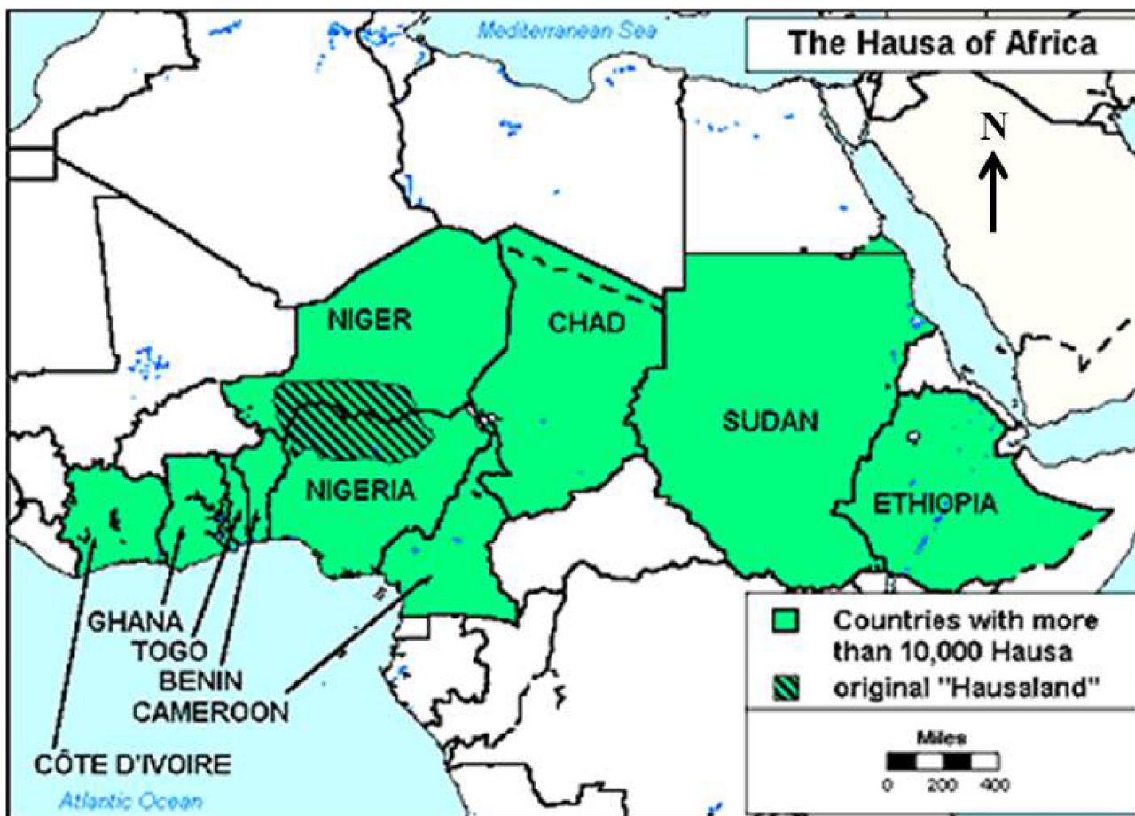
Fig. 1. Map of areas in sub-Saharan Africa showing the distribution of Hausa speaking people. Adapted from Korea Computer Mission (KCM) http://kcm.co.kr/bethany/p_maps1/8035.gif .

ecological knowledge (TEK) and which can act as a useful platform to redistribute sustainability knowledge, including environmental ethics. In many cases, environmental ethics is inherent in indigenous knowledge systems, which include oral narratives and other literary devices (Webster, 1997). Indeed, one of the merits of African narratives is that a single story can be analysed in the context of a wide range of environmental and sustainability issues.